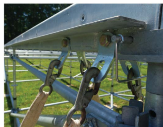
Built-in tie-downs and tent upright shoring points mean safer, more secure installations