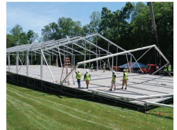
No other tent flooring system assembles and disassembles faster, every time