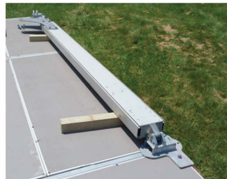
Integrated manufacturer's baseplates speed assembly process and eliminate the need to square the tent